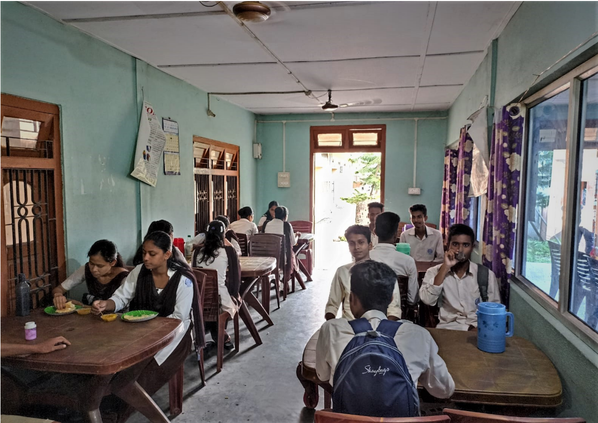
Students enjoying delicious snacks

The college has its own canteen, which serves healthy and nutritious food to its students. The menu varies from spicy samosas, wafers to full-meals. The college canteen was donated by Sipajhar College Teacher's Unit.