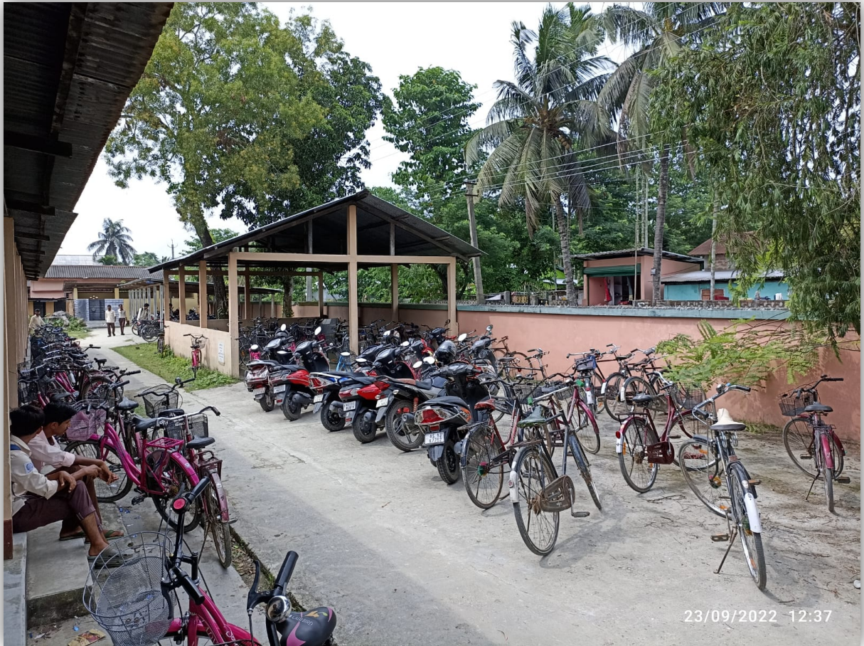
Bicycle and Two wheelers parking stand